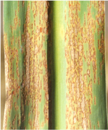
FIGURE 1 | Orange rust pustules in clumps.