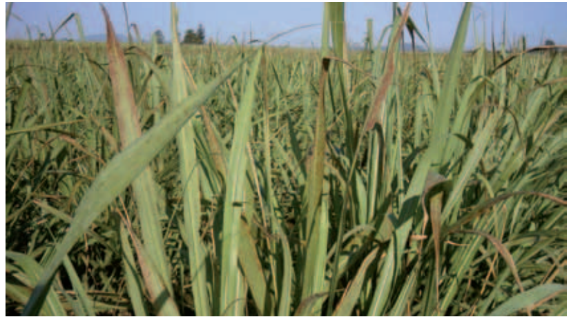
FIGURE 2 | Brown rust in Q190 ® . Pustules are more towards the tip.